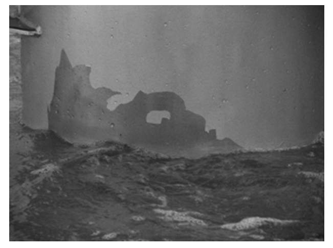
Figure 4: Protective coating peeling off of stainless steel structure Slika 4: Prikaz slabe površinske zaščite nerjaveče jeklene konstrukcije v kopalnem bazenu

stainless steel. However, this did not ensure adequate protection; as shown in Figure 4 the protective layer peeled off the protected surface and consequently the investor enforced the warranty for the waterslide structure.