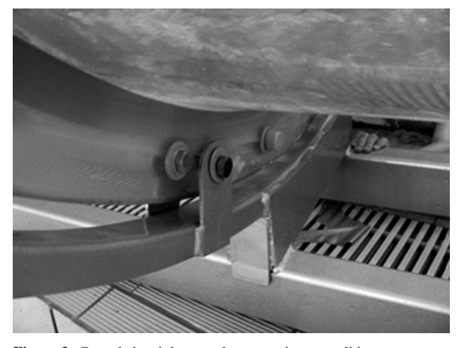
Figure 3: Corroded stainless steel nuts on the waterslide structure Slika 3: Prikaz korozije na matici izdelani iz nerjavnega jekla na konstrukciji tobogana

We note that in the table of stainless steels recommended for swimming-pool construction by the Deutsches Institut für Bautechnik, AISI 316 and AISI 316Ti are not listed. <sup>8</sup> This was overlooked by the designer, thus the resulting corrosion is not a coincidence and corrosion appeared on the stainless-steel nuts ( Figure 3 ), which can endanger the the stability of structure. Due to the occurrence of corrosion, protective coatings were applied to the inappropriately chosen