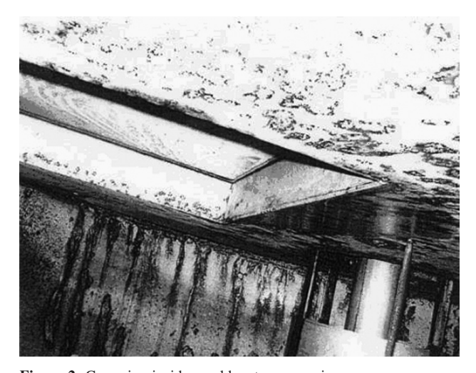
Figure 2: Corrosion inside a cold water reservoir Slika 2: Korozija v notranjosti rezervoarja hladne vode

In the analyzed cases of the internal water-supply network, we found that multiple chlorine shocks and large concentrations of disinfectants ( Table 1 ) resulted in the dissolution of zinc coatings on steel pipes. Corrosion also occurred inside stainless-steel water tanks ( Figure 2 ).