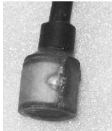
Figure 2: Measuring piezoceramic hydrophone

The calculation of the impedance of the cavitator-environment system Z was based on the measurement of