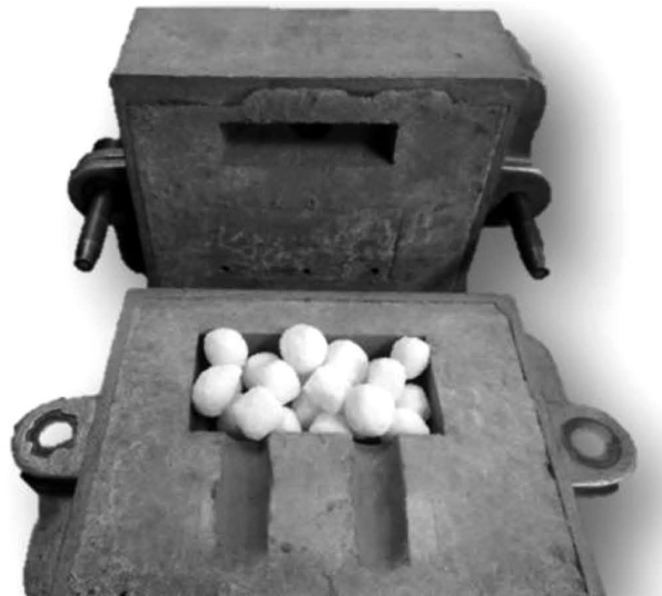
Figure 2: Mould cavity filled with salt precursors

the same size, shape and properties. The mould cavity with dimensions of 30 \times 60 \times 120 mm was filled with precursors ( Figure 2 ) and after the mould was manufactured, the melt – the AlSi10MgMn aluminum alloy with a casting temperature of 730 °C – was infiltrated. Four minutes after the casting process, the casting was immersed into water to flush the precursors out. An example of the resulting casting is shown in Figure 3 .